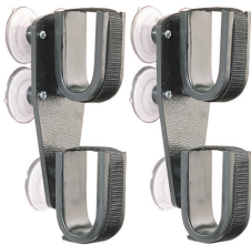
Double-Hook Holder Part No. 10020